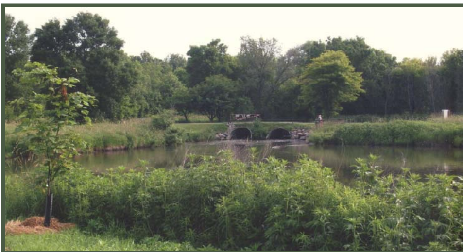
Token Creek County Park